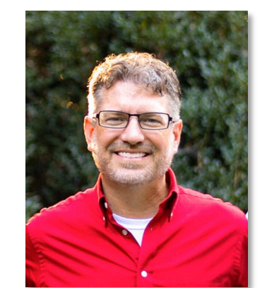
"There is a battle raging in our world, and it is not between political parties or people of different races."

But we are better than that. We are children of the King, coheirs with Christ Jesus, more than conquerors. Our battle is not against flesh and blood, but against powers and principalities. Our weapons of war are prayer, faith, our