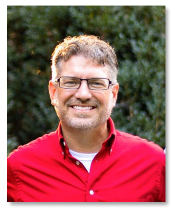
"1 am reminded that any trial I face is an opportunity for me to grow in grace. "

Brothers and Sisters, please hear my heart. I do not wish to belittle your struggle in any way. Some of you have gone through so much more than I have, and I grieve with you. I simply want to offer hope. When you feel alone, know that you are not. You have so many around you who care about you and what you are facing. You have a Father in heaven who is fully aware of your situation. You are loved, and your prayers are heard. As we walk this road together, I pray we will learn what God is teaching us, and we will be stronger, more faithful followers of Jesus.