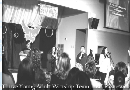
Thrive Young Adult Worship Team, FBC Barnesville

Call 706-647-4959 or email cbawomensministries@gmail.com for more information.