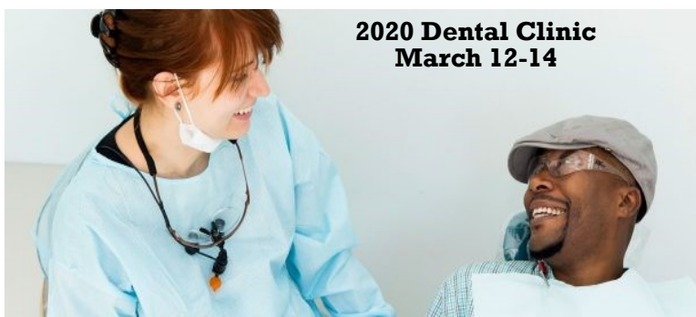
2020 Dental Clinic March 12-14

Meansville Campus of the Georgia Baptist Children's Home 2821 US Hwy 19, Meansville, GA 30256