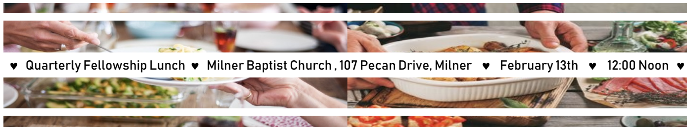
♥ Quarterly Fellowship Lunch ♥ Milner Baptist Church, 107 Pecan Drive, Milner ♥ February 13th ♥ 12:00 Noon ♥

Only God knows what He will do through us this year. My prayer is that He calls out missionaries, pastors, musicians, teachers, servants, counselors, greeters, singers, worshippers, cooks, woodworkers, hunters, athletes, men, women, students, children from all walks of life to go and make disciples this year. Join me in prayer and in this work!