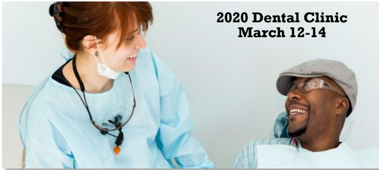
2020 Dental Clinic March 12-14

Pritchett Memorial 496 Jugtown Road Meansville 30256