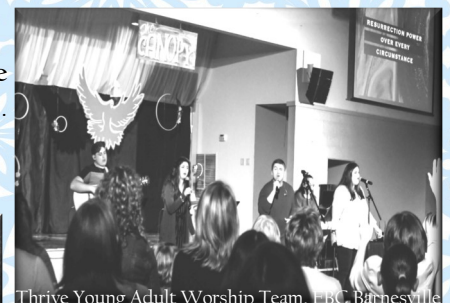
Thrive Young Adult Worship Team, FBC Barnesville

"As for you, let that abide in you which you heard from the beginning. If what you heard from the beginning abides in you, you also will abide in the Son and in the Father." 1 John 2:24