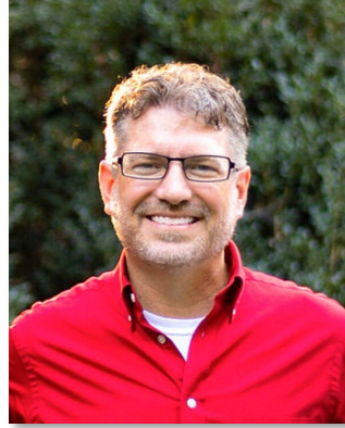
"Your pastor feels your pain more than you know."

when the state of things change rapidly. They see how vital ministries have been put on hold and long for a day when they can begin again. Your pastor feels your pain more than you know. He bears your burdens even when you don't notice. So, thank you for extending some grace to him as he seeks to follow God down this uncertain path.